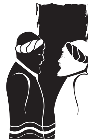
Table topic: Lofty spiritual visions do not escape the practicalities of living in the real world (e.g., a person of prayer still has to pay the mortgage!). Describe the material-spiritual tensions/opportunities in your own life.